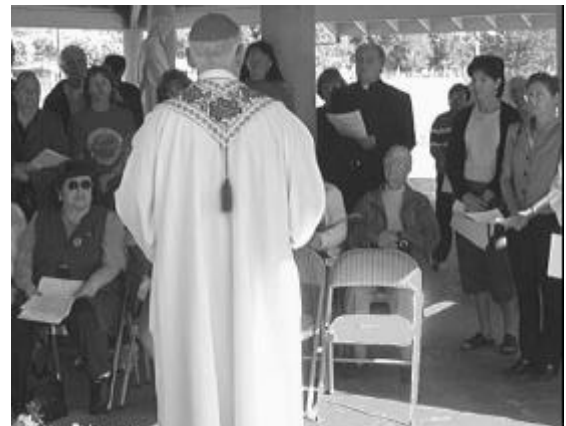
Bishop Weigand speaking at the Memorial Dedication

The superintendent of St. Mary's Cemetery, Monte Latino, made sure the policies of the Department of Cemeteries were followed in this project. The monument was engraved and placed by the Ruhkala Monument Co. of Sacramento.